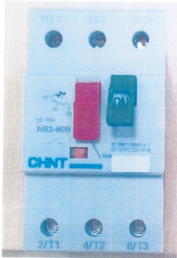
Images of NS2-80B

Signed for and on behalf of Zhejiang CHINT Electric Co., Ltd. — Chint Industrial Zone, January 29, 2021